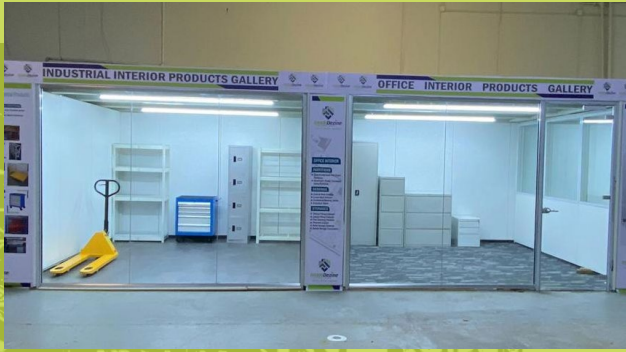
WAREHOUSE IN HOUSTON, USA