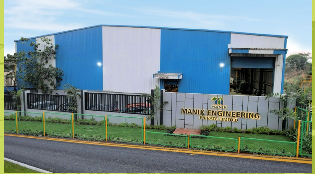
MANUFACTURING FACILITY IN INDIA